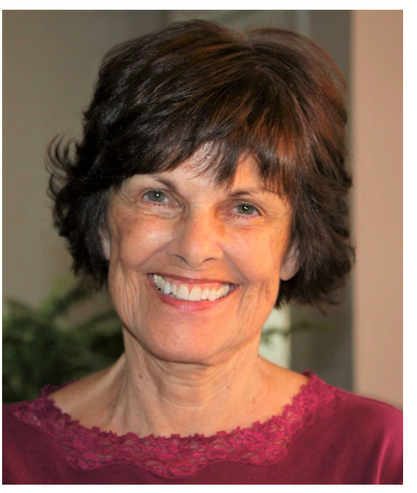
To the Glory of God & In Loving Memory of