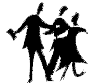
Greeters & Ushers