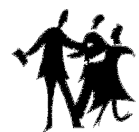
Greeters & Ushers