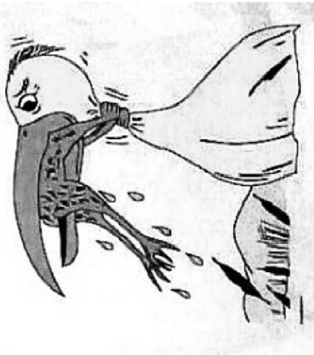
Picture sent in from one of our members after listening to the sermon, "Never, ever give up!"