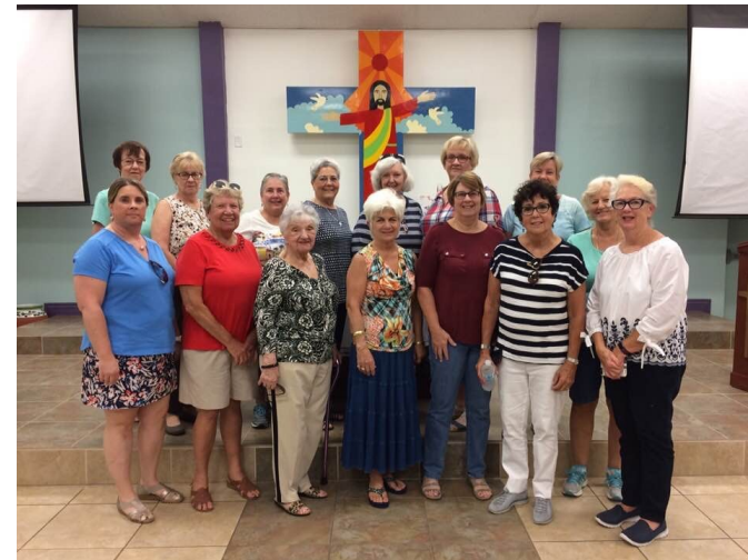
Beth-El Farmworker Ministry, Inc.